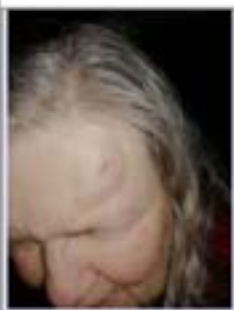
Marit Tax Code