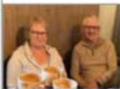
Odd Barn slide