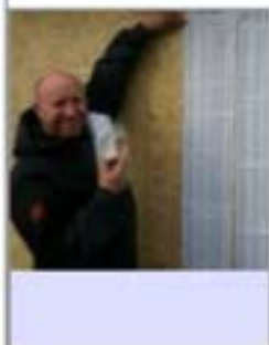
Henning Whip wheel Endeberg