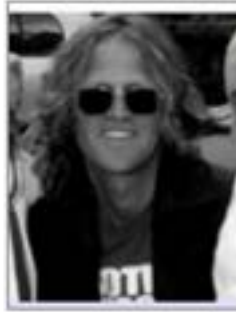
Inherit Christian Lode