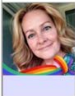
Little Hege The marshland Ruud