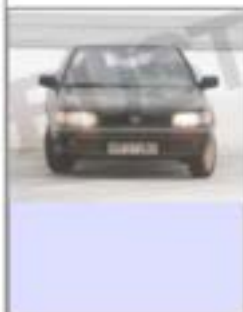
Gjermund Wood house