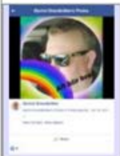
Øyvind The beach cliff