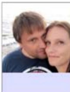
Day Frodo The lobe