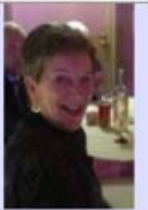
To see Hofton