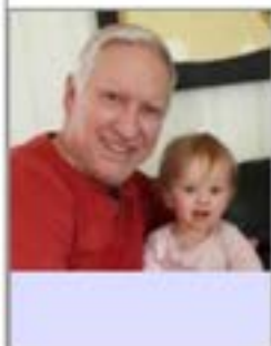
Rowing The garden