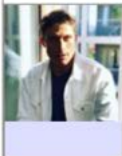
Rustam Louis waterfall