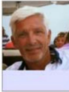
Peder van der The garden