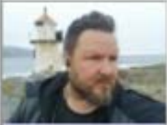
Stian Seat style