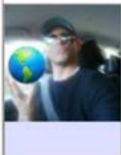
John Barclay Rivets