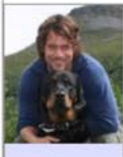
Øystein The plain