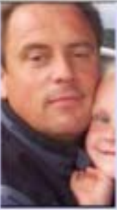
Rowing Mountain bed