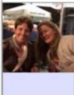
Unni The medal