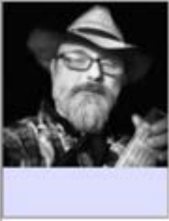
Einar The cove