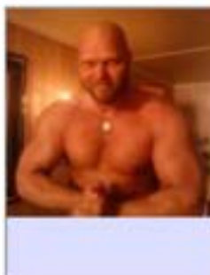
Day André Burnt soil