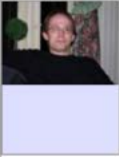
Kai Tore Wood house