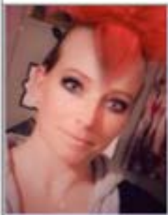
Hilda Wood house