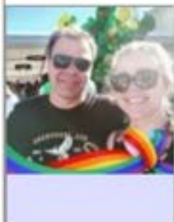
Goril Pile of roses