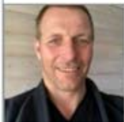
Stian Water valley