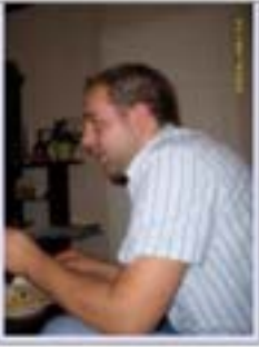
Håkon The pile